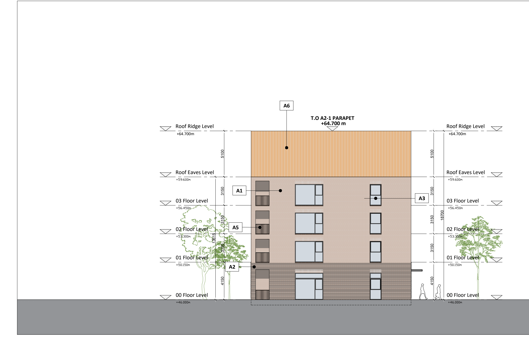
BLOCK 2 EAST ELEVATION