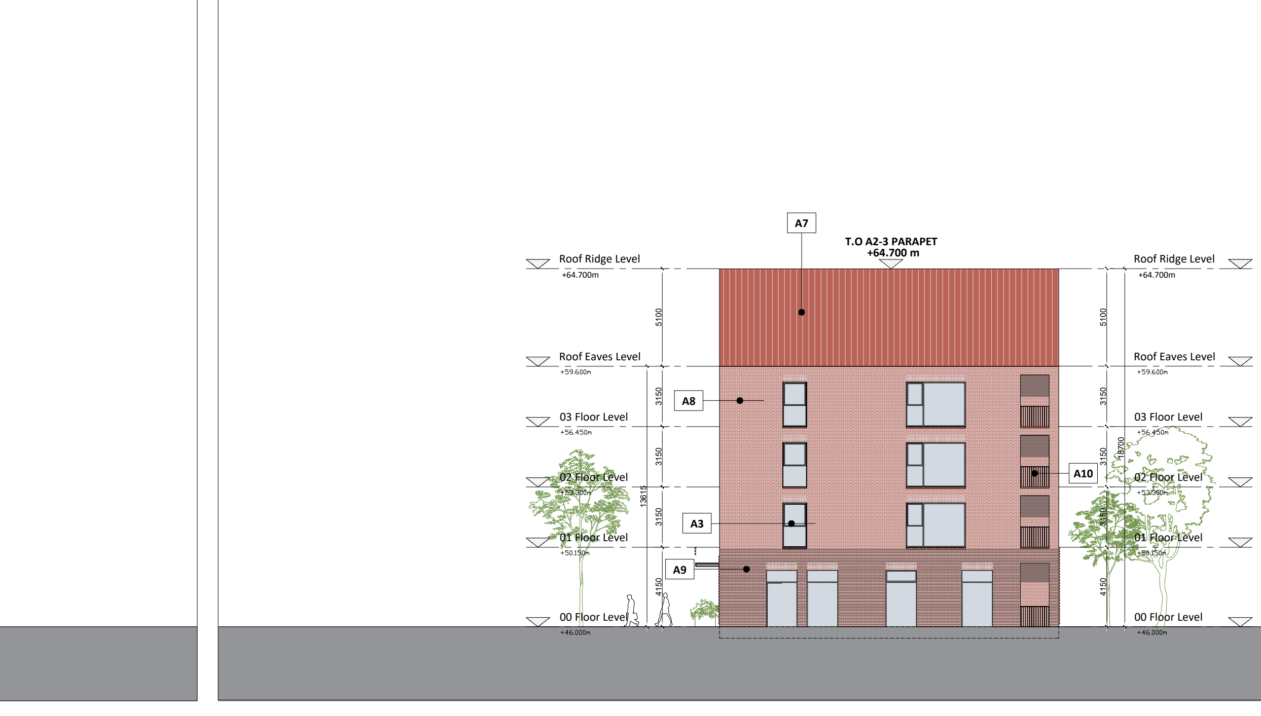
BLOCK 2 WEST ELEVATION 1:200@A1